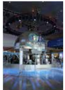
Example: 8k GIF File