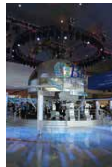
Example: 28mb TIFF File